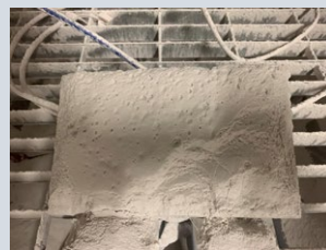
Dust chamber test

An independent institute has subjected the Fabro KNX touch panel to the prescribed tests and confirmed the protection degree IP66.